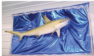
Our new guard shark!

We have recently acquired a new addition to our facility: