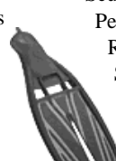
Adjustable Twin Jet