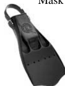
Traditional Jet Fin