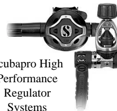
Scubapro High Performance Regulator Systems